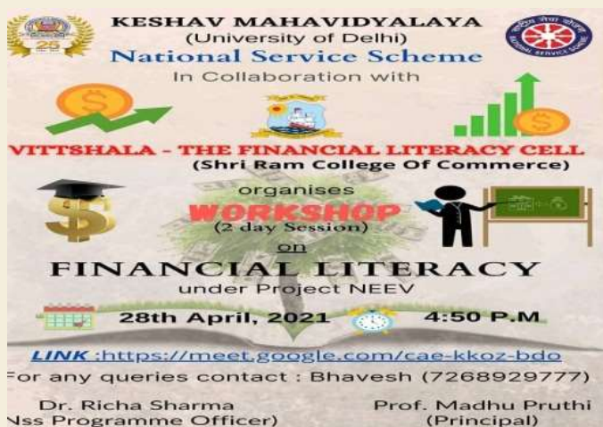
Workshop on Financial Literacy in Collaboration with SRCC