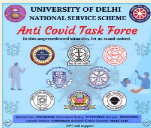
Anti Covid Task Force