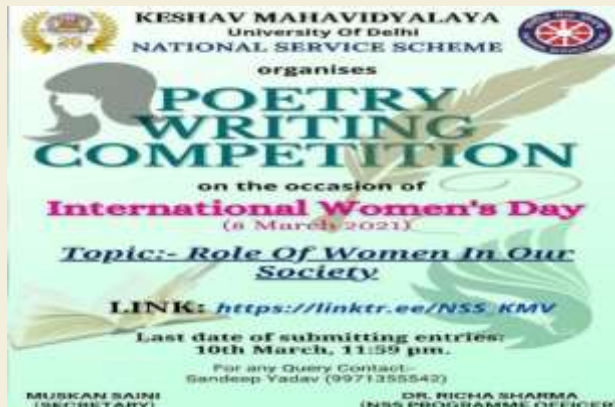
Poetry Writing Competition on International Women’s Day