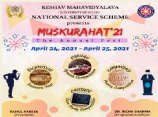
NSS Annual Fest ‘Muskurahat 21